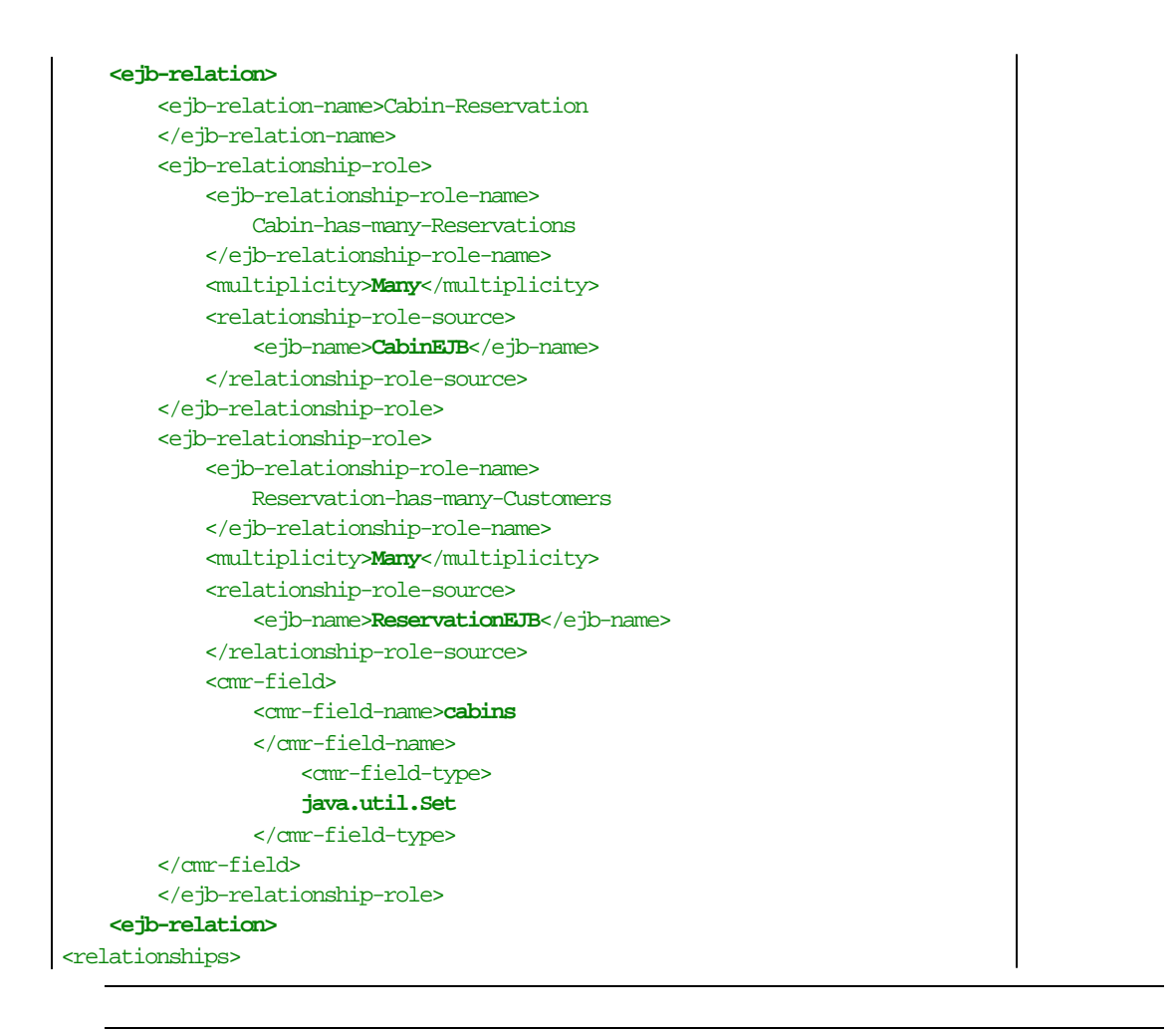
∠ Æxercise 7.2, Reservation relationships